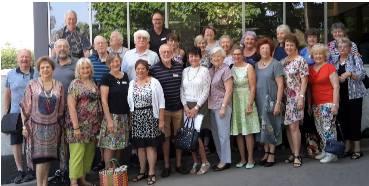
“the illawarra mob”